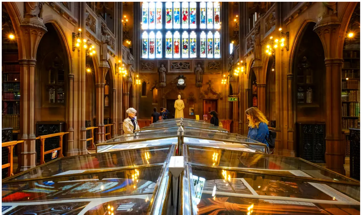
John Rylands Library, Manchester

“We will be interested to see how the strategic initiatives pan out in the environmental sector.”