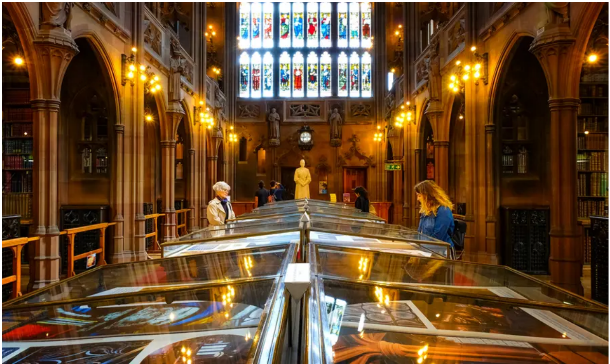
John Rylands Library, Manchester

“We will be interested to see how the strategic initiatives pan out in the environmental sector.”