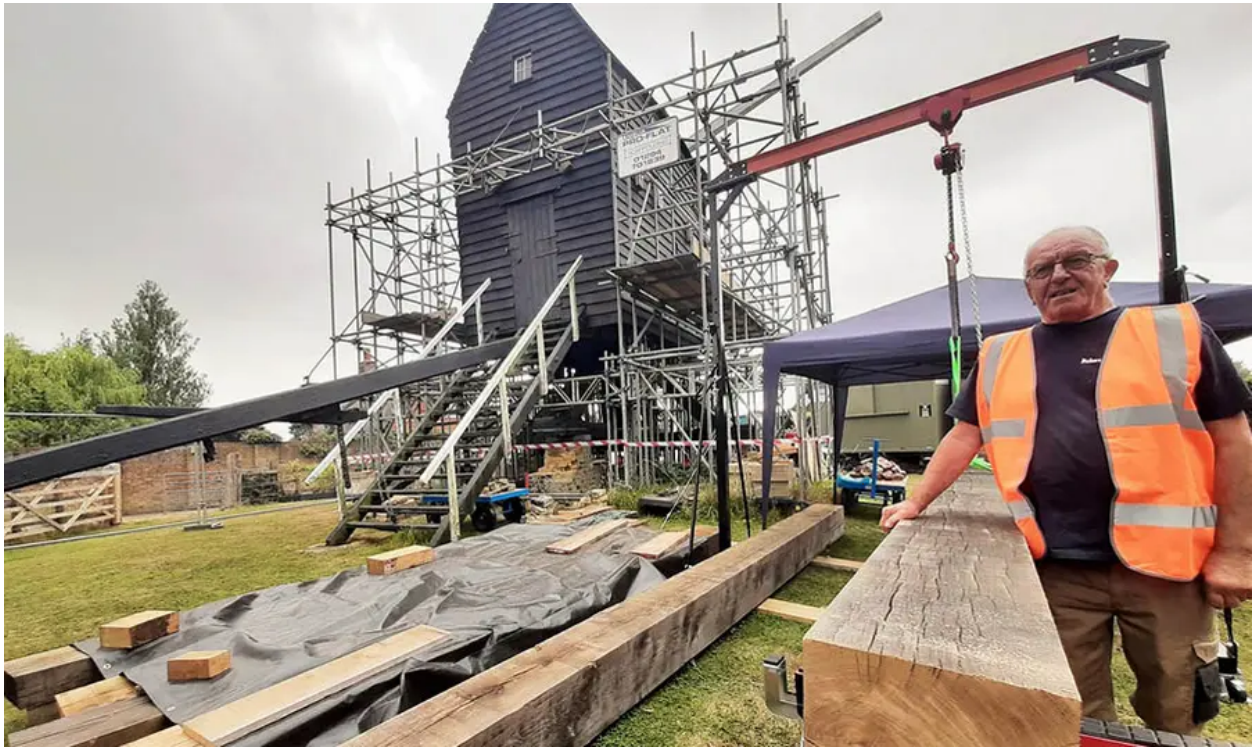
Scaffolding lifted the mill while the huge oak beams that support it were replaced.

The supporting wooden tresses and brick foundations have been replaced, ensuring the mill’s survival for future generations to learn about this part of the UK’s industrial heritage.