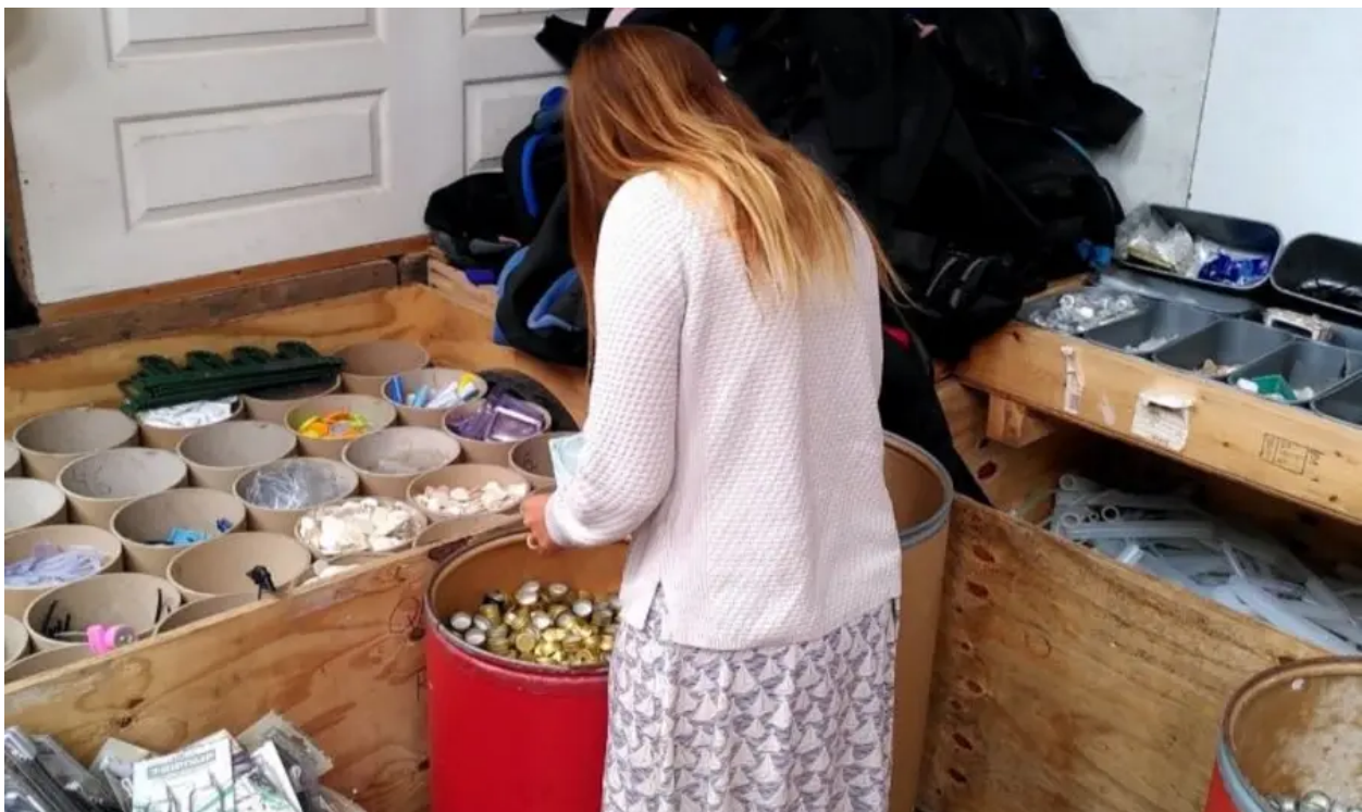
Using waste materials found in a scrap store.

Previous winners of the Sustainable Project of the Year category were Penzance's Jubilee Pool and the Museum of Oxford's Queering Spires: a history of LGBTIQ+ spaces exhibition.