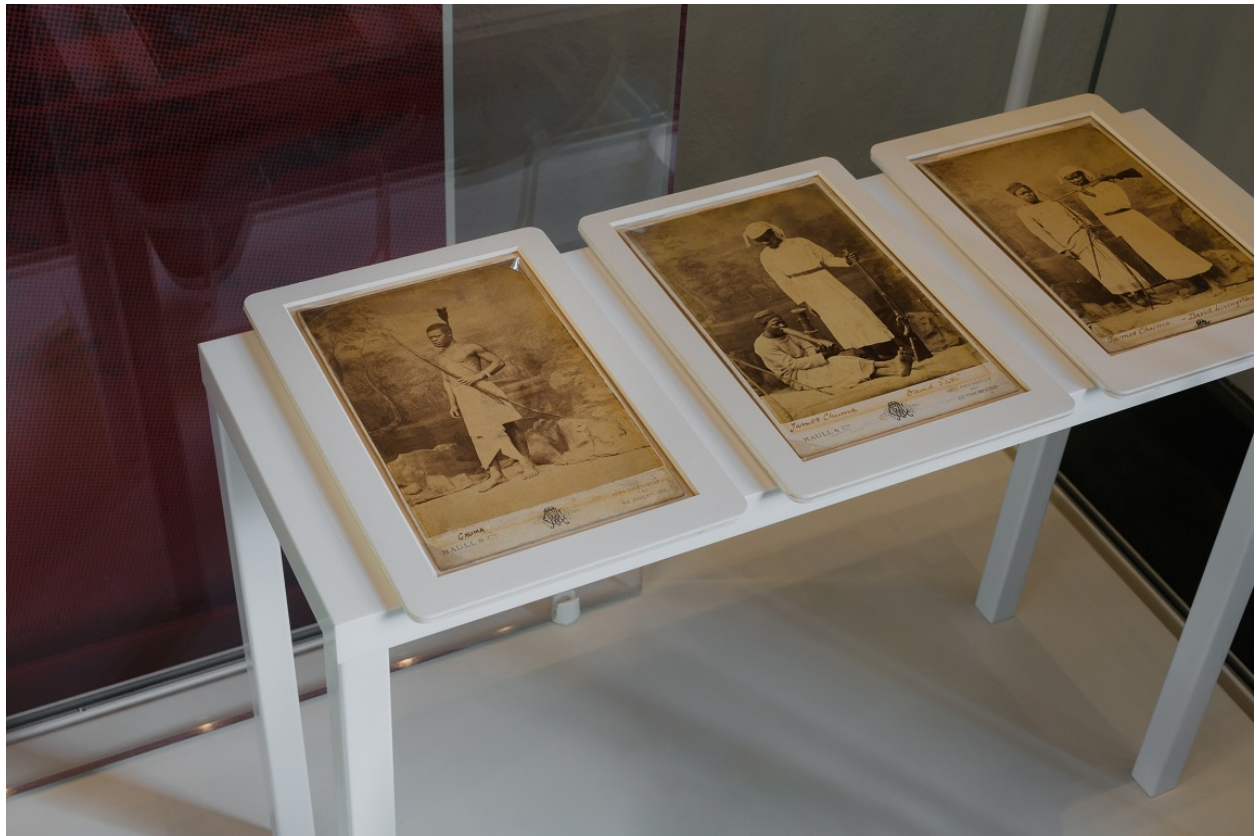
Staged photos of Susi and Chuma.