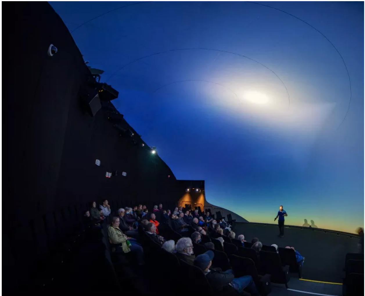
The Space Dome at Jodrell Bank.