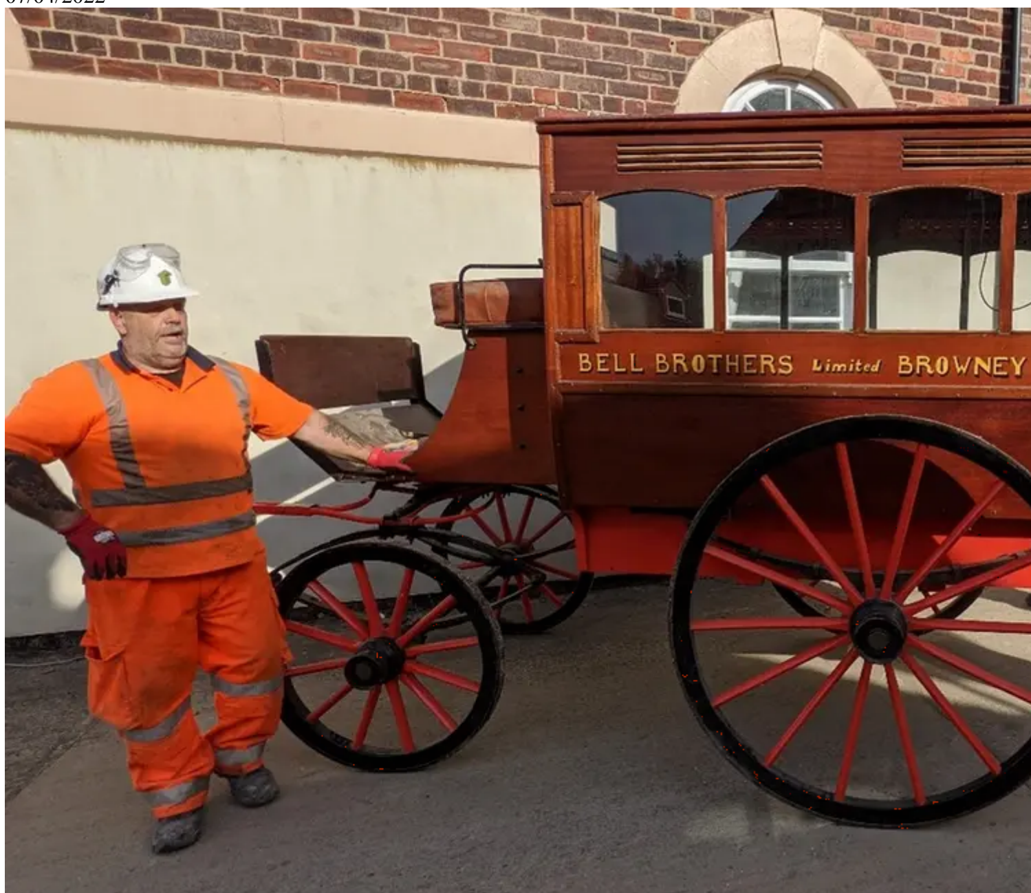
Cleveland Ironstone Mining Museum in North Yorkshire to be renamed Land of Iron when it reopens in autumn 2022.

The new name better reflects the visitor experience following the museum's £2.3million revamp.