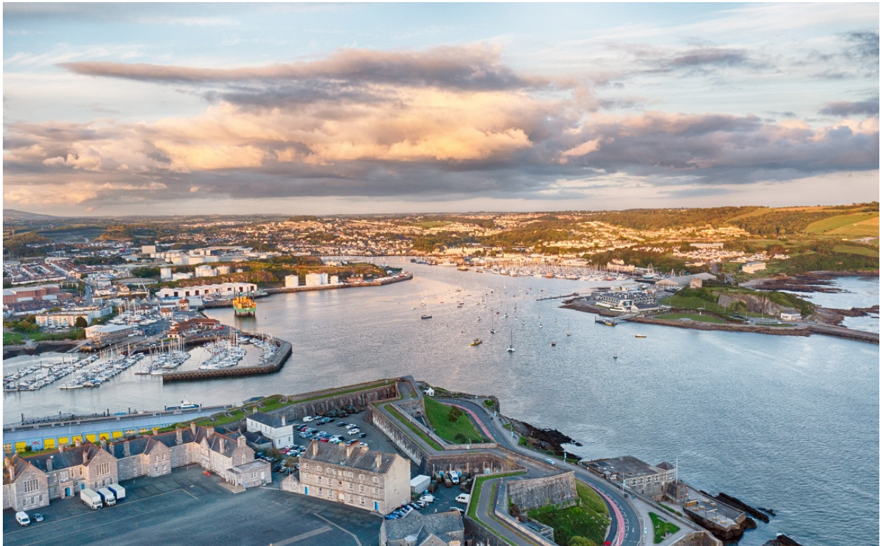
Plymouth has rich marine and coastal heritage.

You can find out more by visiting Plymouth Sound National Marine Park's website .