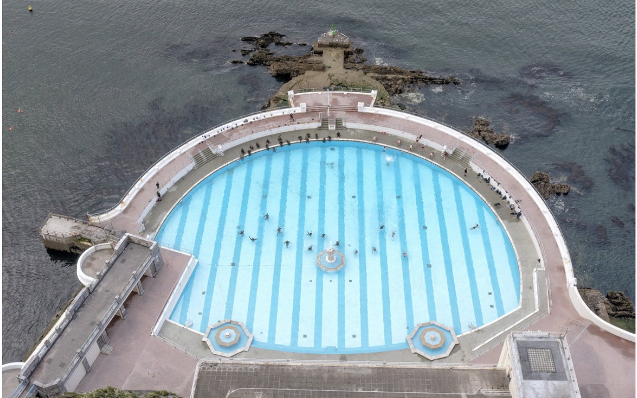
Plymouth Lido.

Plymouth Sound National Marine Park was one of five projects to be awarded funding in 2021.