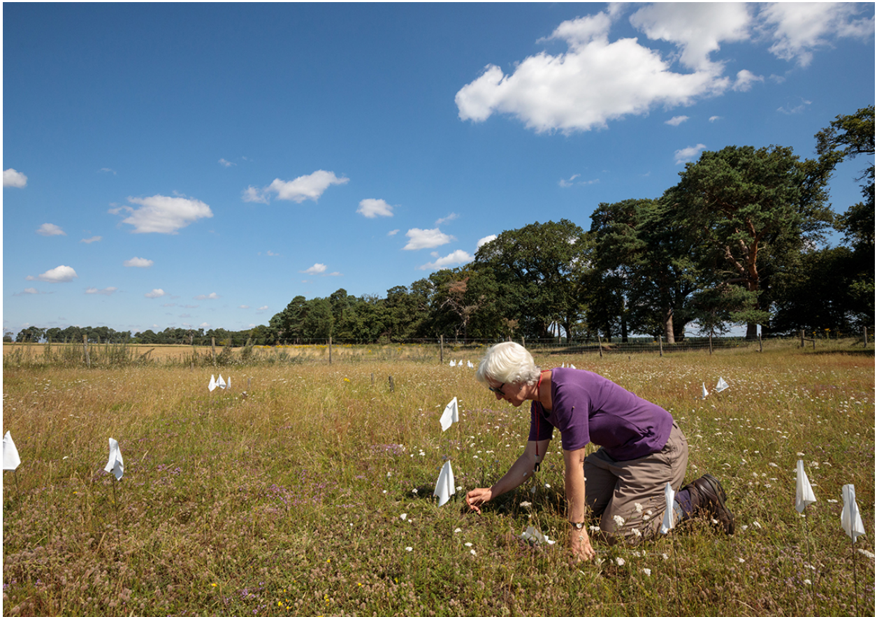
Back from the Brink 'Shifting Sands' project - Prostrate perennial knawel survey