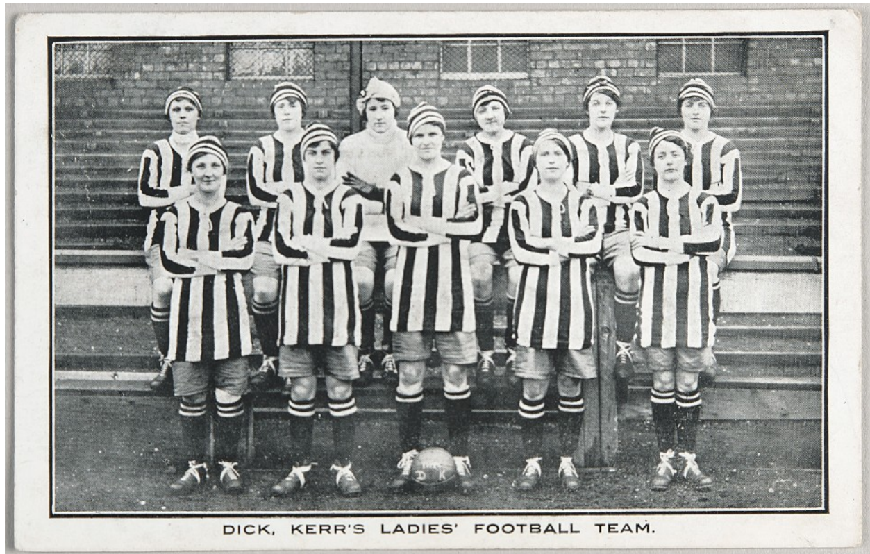
Dick, Kerr Ladies, formed in Preston, 1917.

In a year which also marks 141 years since the women's England team first played competitively , the project will challenge the perception of football being 'new' for women and improve how the sport is understood.