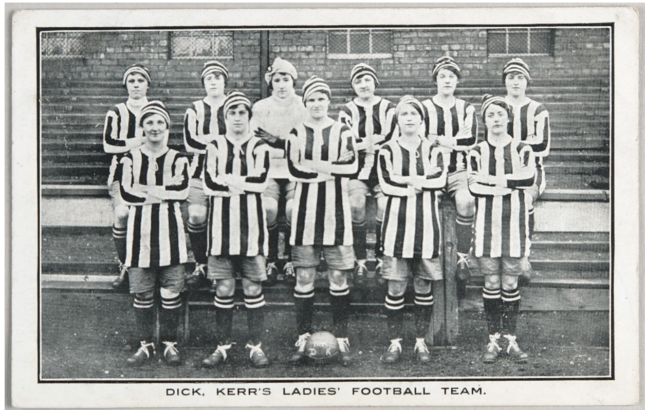
Dick, Kerr Ladies, formed in Preston, 1917.

In a year which also marks 141 years since the women's England team first played competitively , the project will challenge the perception of football being 'new' for women and improve how the sport is understood.