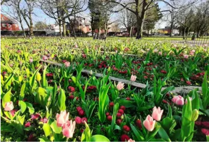
Flower beds in Victoria Park in Cardiff