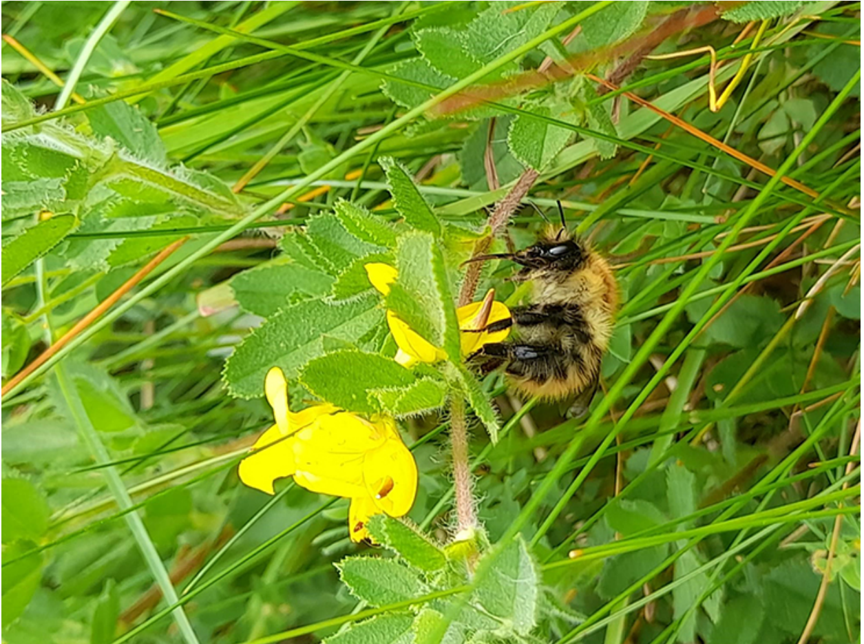
A bee - one of our precious pollinators.

The work will target young people, with traineeships, volunteering and schools opportunities.