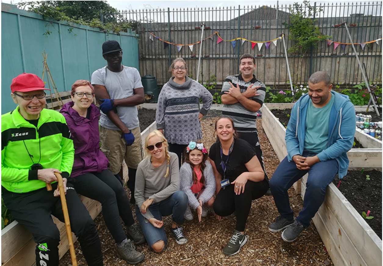
The Mersey Forest team.