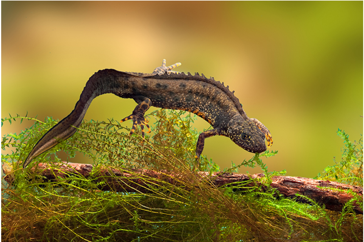
Great crested newt - a UK protected species set to benefit from the recovery corridor.