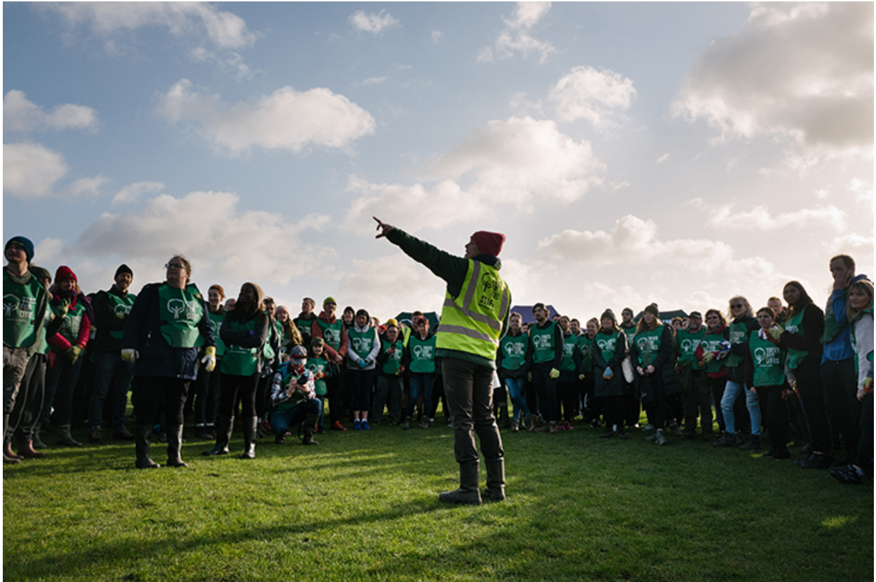
Trees for Cities team working in Hackney.