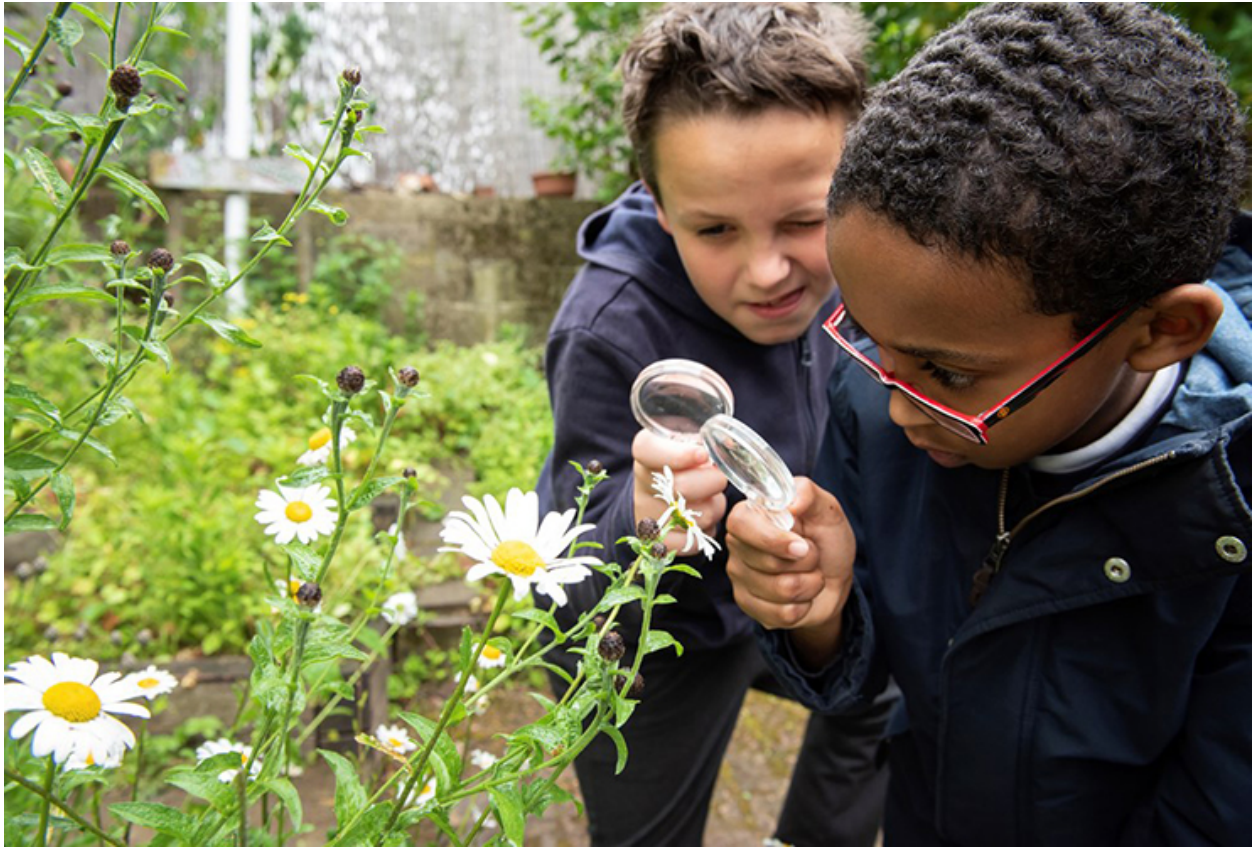
Children engaging with nature.