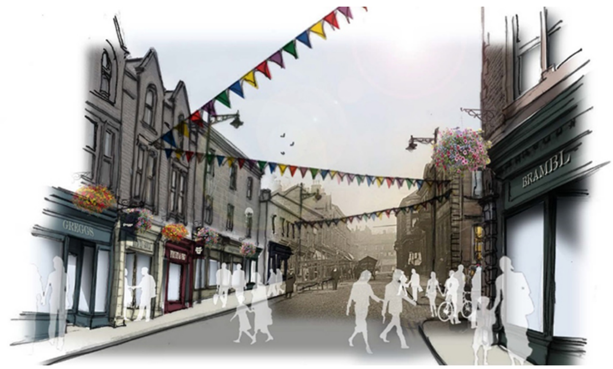
Artists impression of the regenerated town centre