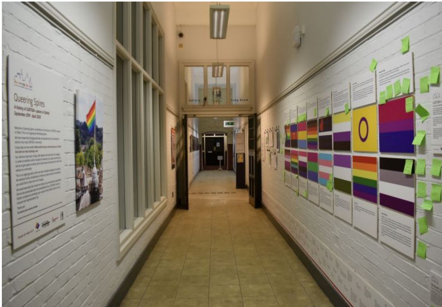
The entrance hallway to the Queering Spires exhibition at the Museum of Oxford