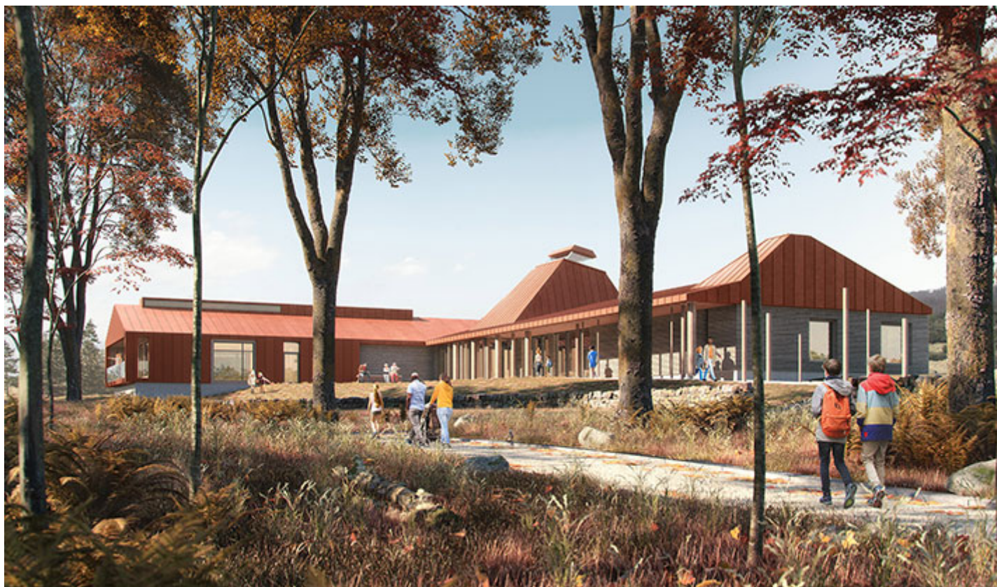
Visualisation of Dundreggan Rewilding Centre.

Dundreggan, a 10,000-acre estate in Glenmoriston near Loch Ness, has received a National Lottery Heritage Fund grant of £702,300 for Trees for Life to establish the world’s first rewilding centre.