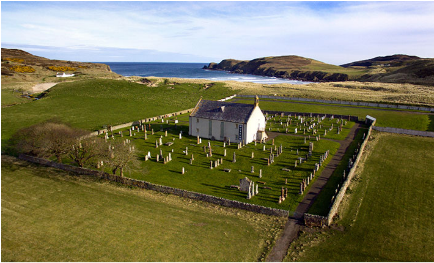
Strathnaver Museum and grounds

Strathnaver Museum, which tells the story of the Highland Clearances and the history of the Clan Mackay, has received a grant of £650,000 to further develop its museum - a former 1750s church.