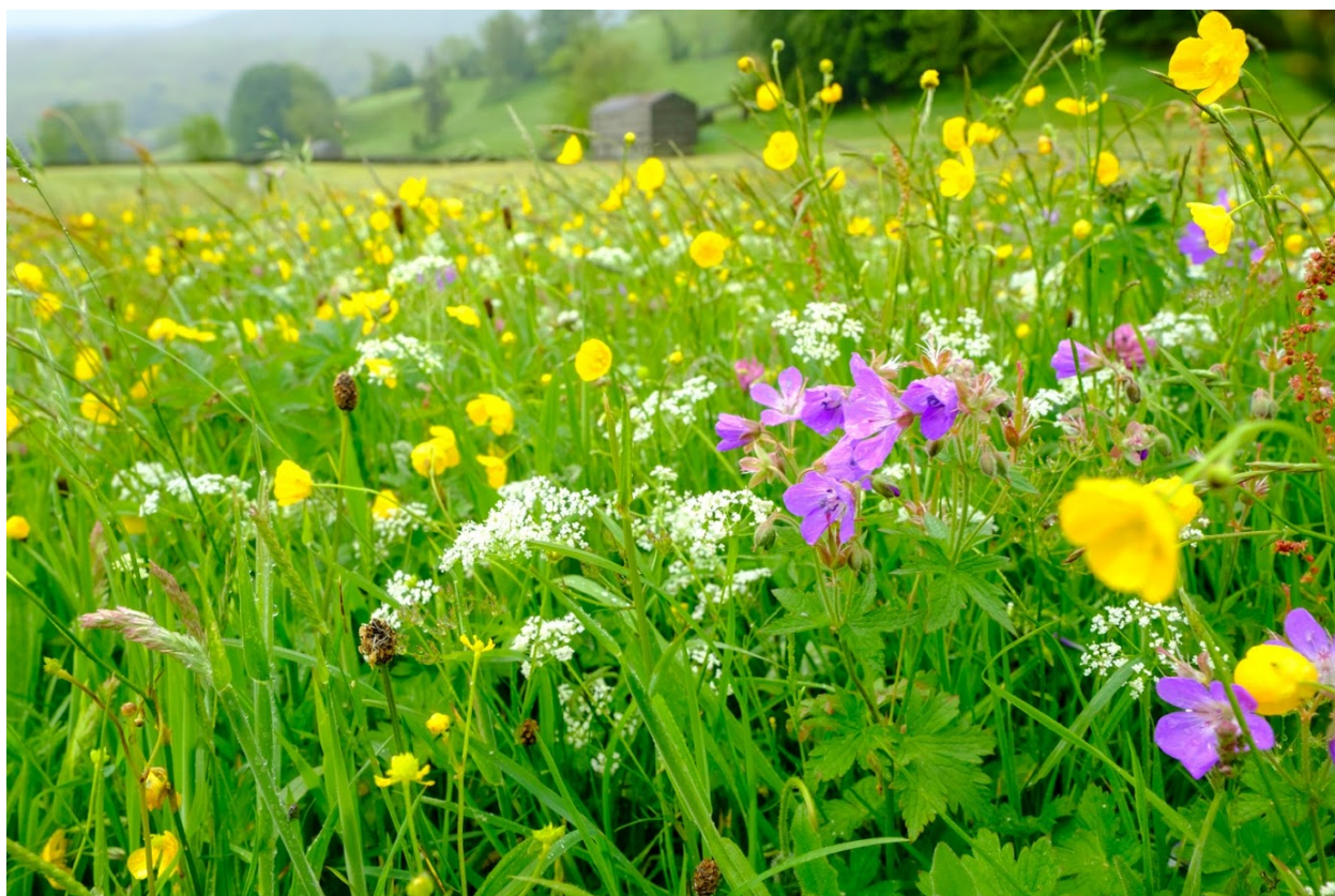
Muker Meadows.