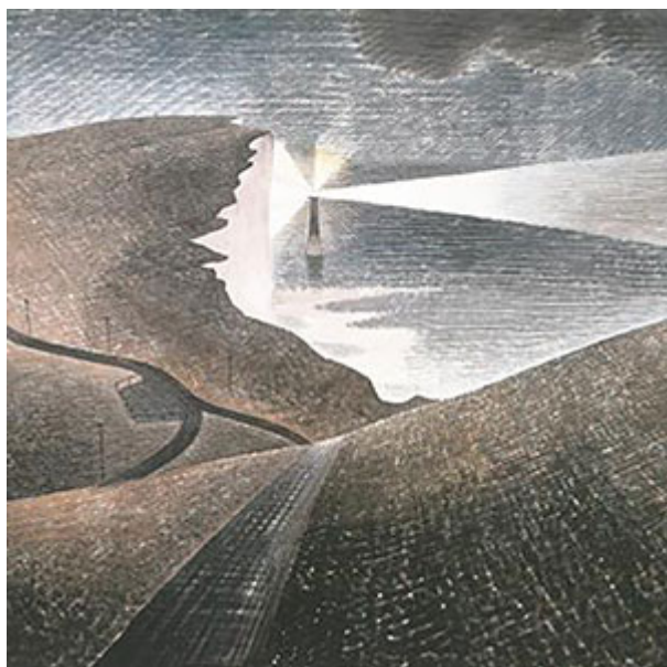
Beachy Head by Eric Ravilious, displayed at Towner Eastbourne