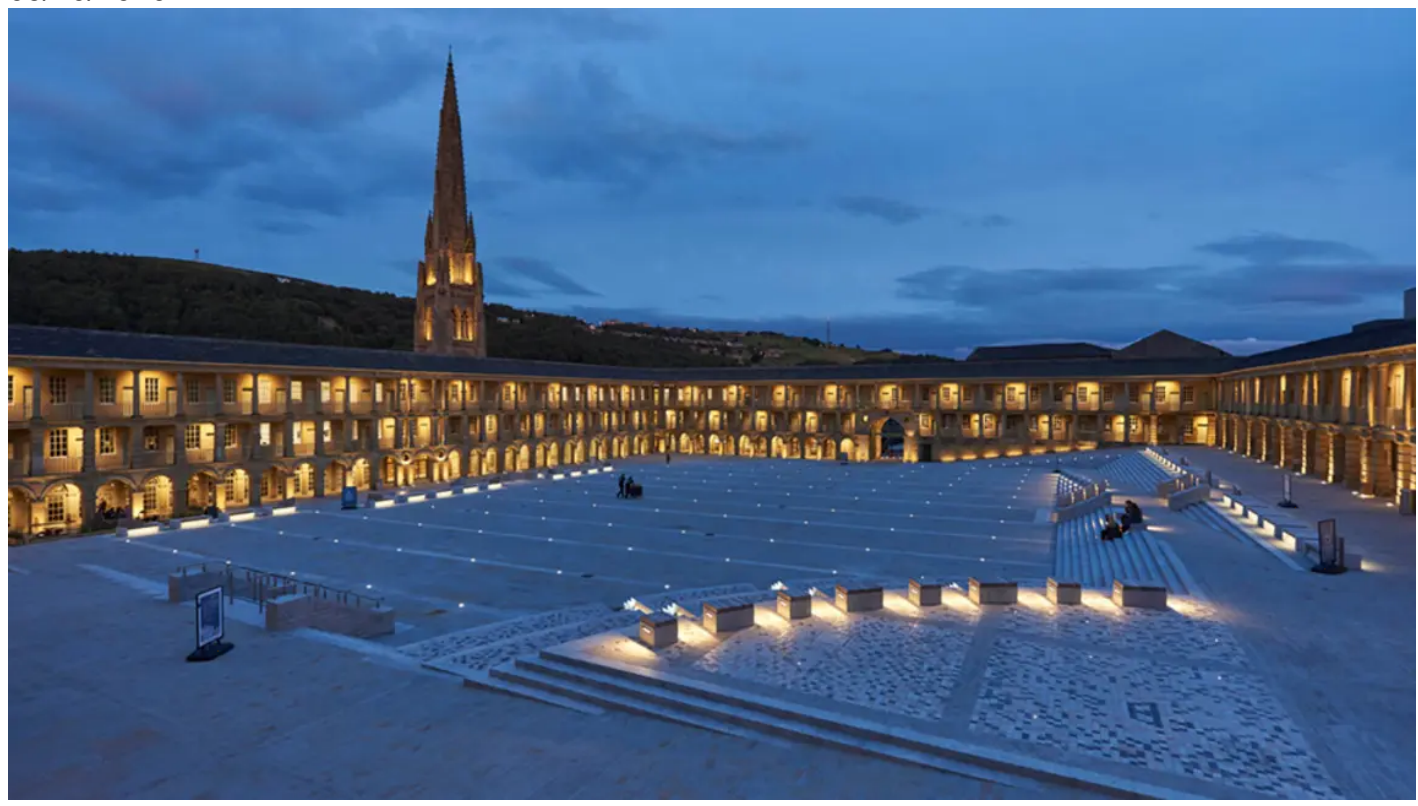
433 organisations in England have received a share of £67million in the first round of awards from the Culture Recovery Fund for Heritage.

The grants – which range from £10,000 to £1m – will protect heritage and save jobs from the impact of the coronavirus (COVID-19) crisis.