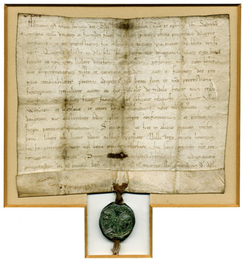
A Papal Bull from Pope Adrian IV, held at the Northumberland Archives

The archives is home to five linear miles of records dating back to 1156. Its £48,100 grant will allow the archives to refocus the delivery methods of its services, install new ways of income generation, and build in resilience.