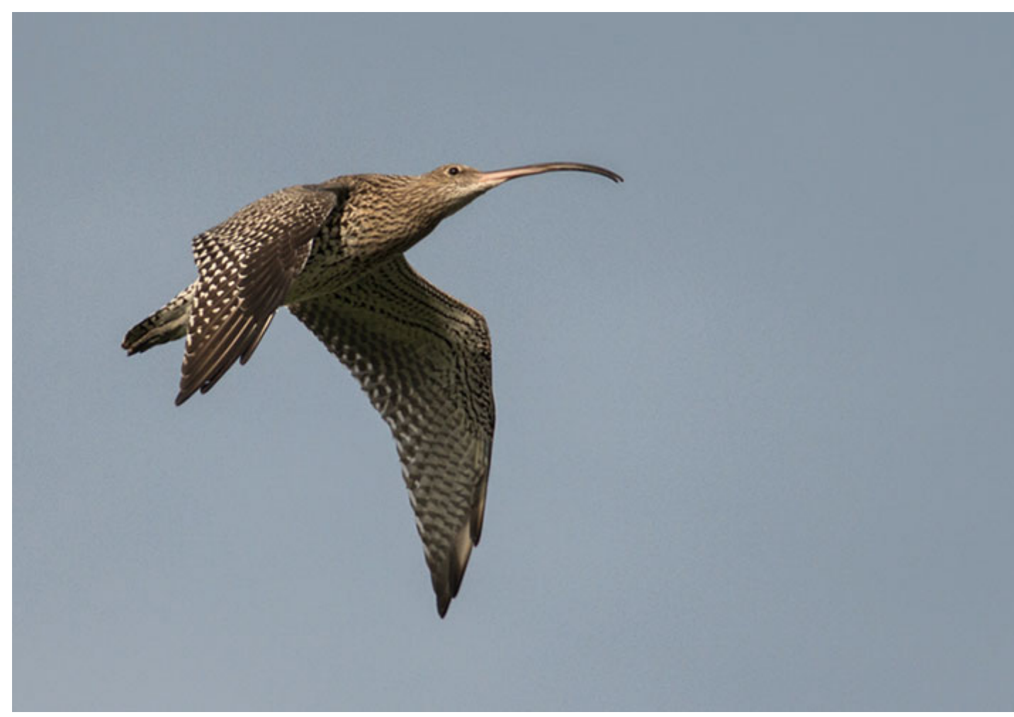
Curlew at RSPB NI.

"We're grateful to The National Lottery Heritage Fund and National Lottery players for helping us reopen our reserves and protect nature at a time when we need it more than ever."