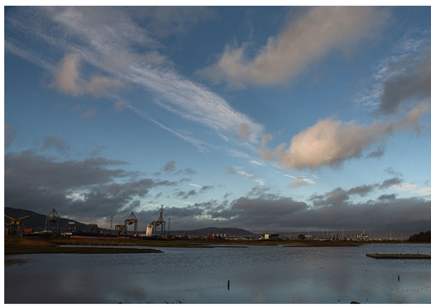
RSPB NI Window on Wildlife.

With uncertainty over what the next few months hold, RSPB NI is developing new digital programmes and creating new ways for the public to connect with nature, right from the comfort of their home.