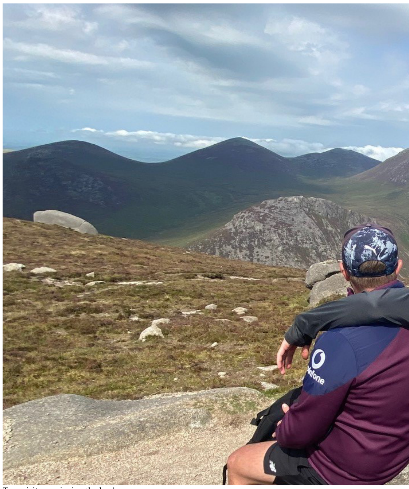
Two visitors enjoying the landscape