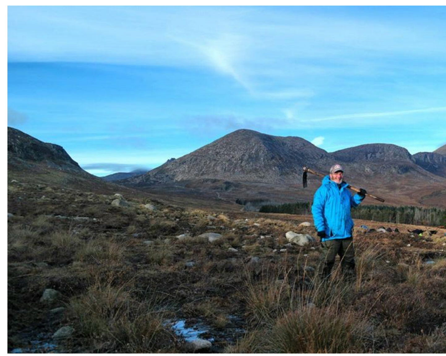
Emergency funding is going towards vital repairs

However, thanks to a grant of £52,600 from our Heritage Emergency Fund, the Trust can now put extra resources into looking after this much-loved landscape in the south- east corner of Northern Ireland.