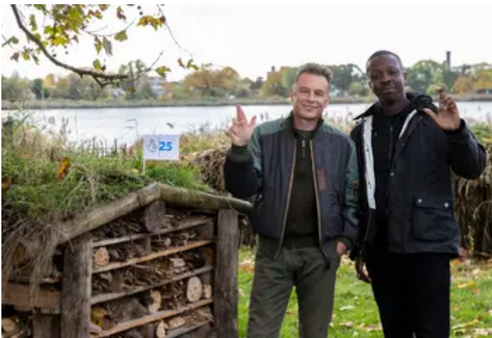
of her home city

Chris Packham and Jamal Edwards celebrate 25 years of funding for nature