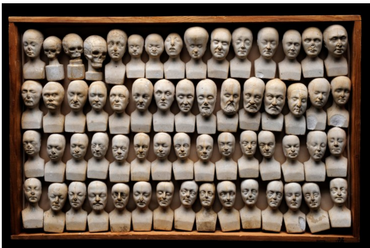
Wooden case containing 60 small phrenological heads.

Here are some of the other galleries and objects that might not exist at the Science Museum without National Lottery funding: