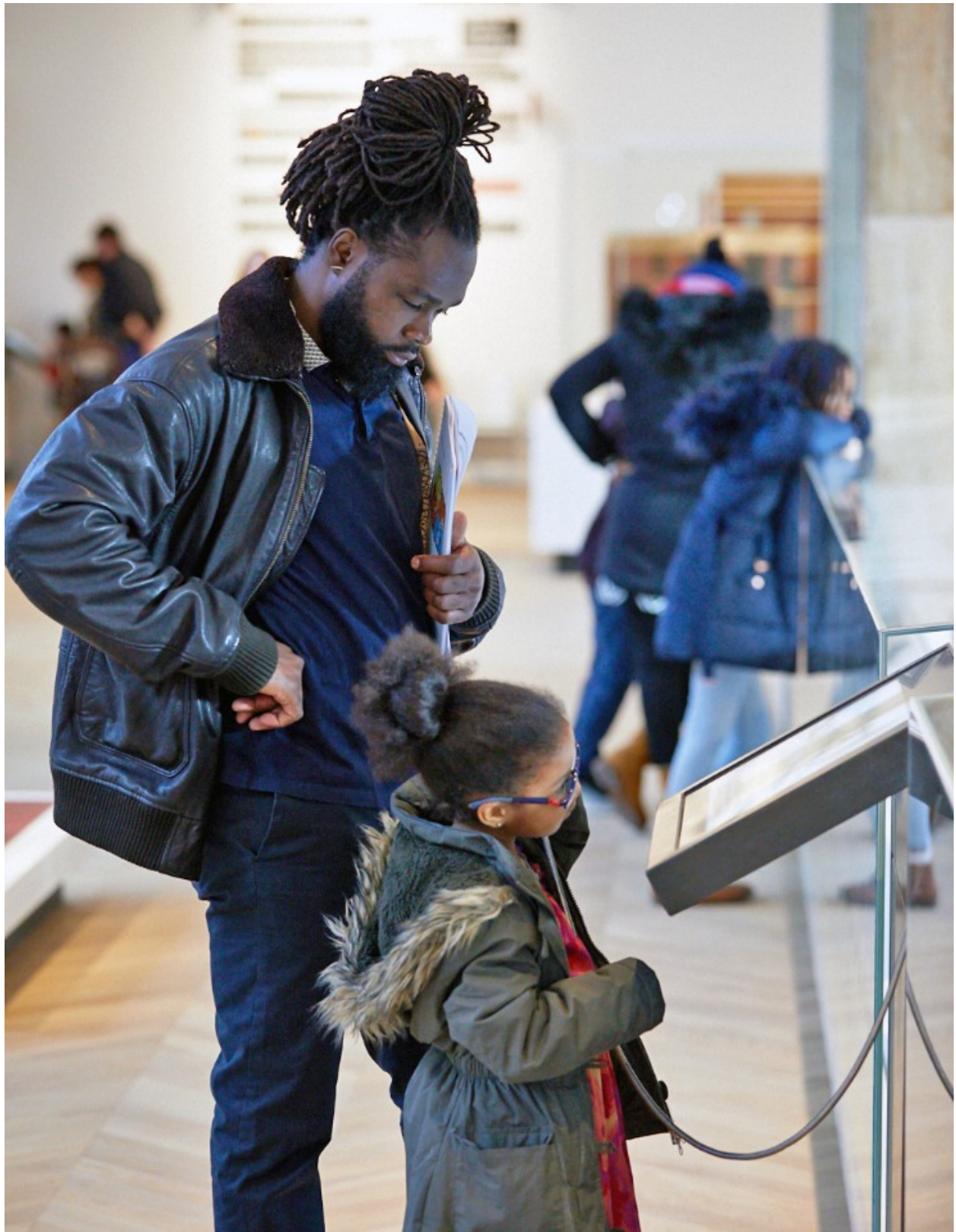
Visitors enjoying the new exhibits in Medicine: The Wellcome Galleries.

Here are some of the things you can do at the new galleries: