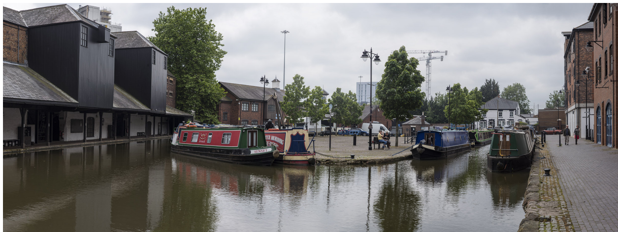
Coventry canal.