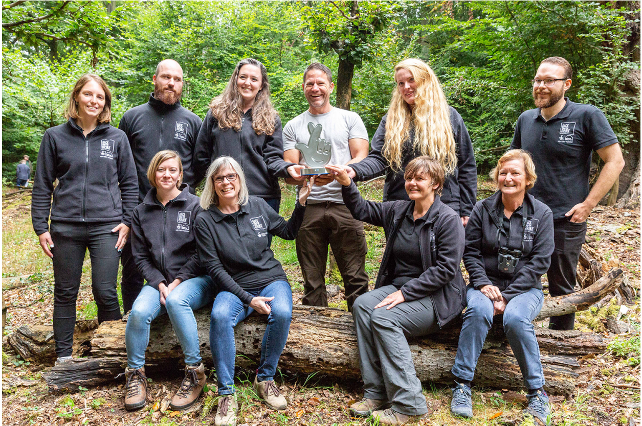
Steve Backshall and the Back from the Brink team

out by 19 projects at more than 40 sites across England.