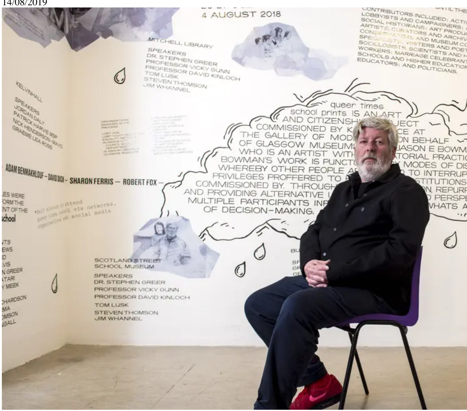
Through including LGBT+ people in conversations about their heritage, one National Lottery-funded project has helped improve representation in Glasgow's museums.

The queer times school prints exhibition was held at Glasgow's Gallery of Modern Art (GoMA) from 1 December 2018 to 10 March 2019.