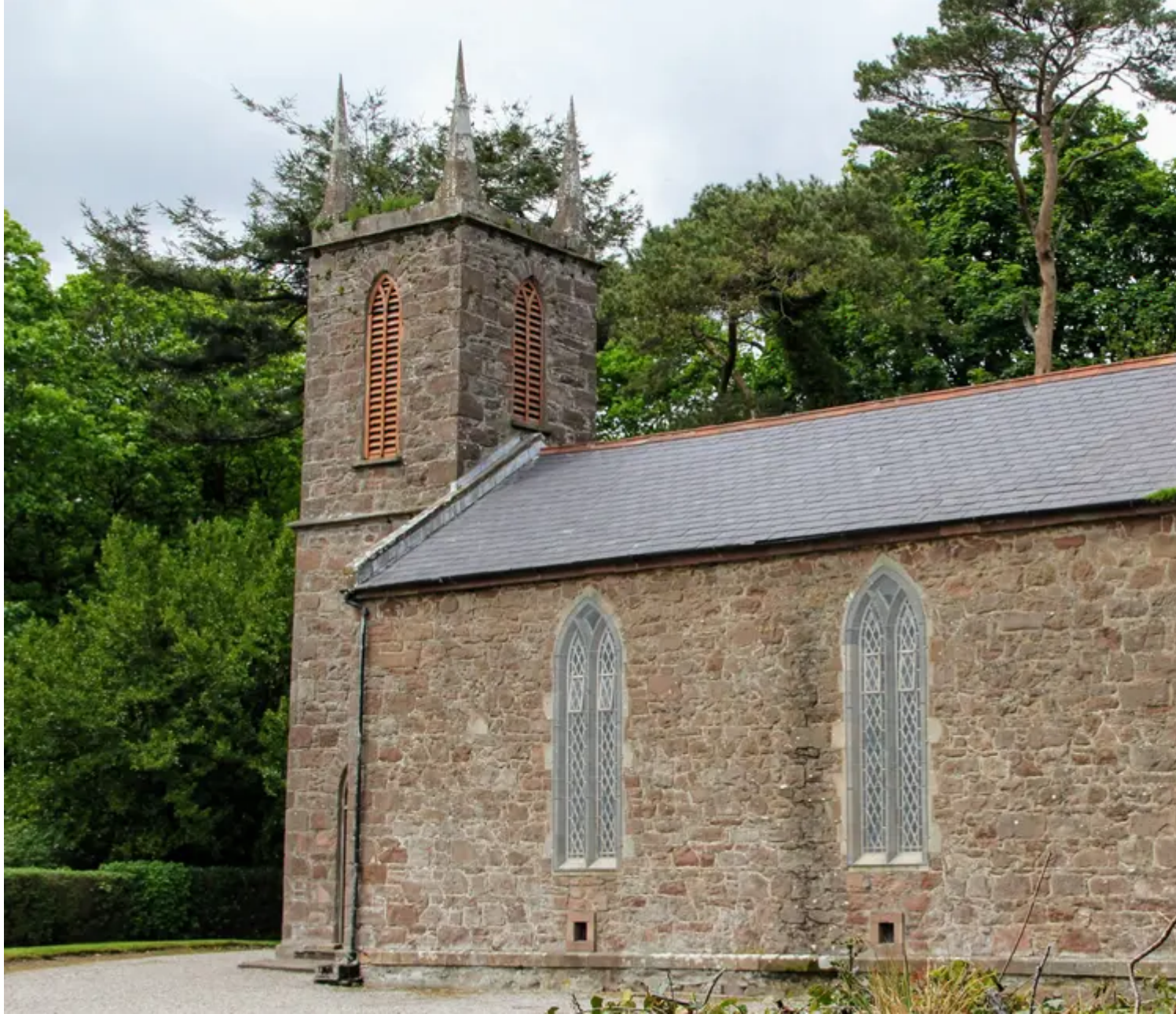
After 13 years of campaigning and fundraising by local people, The Old Church Centre has opened in Cushendun, County Antrim.

The old church building was runner-up in the BBC Restoration series in 2006.