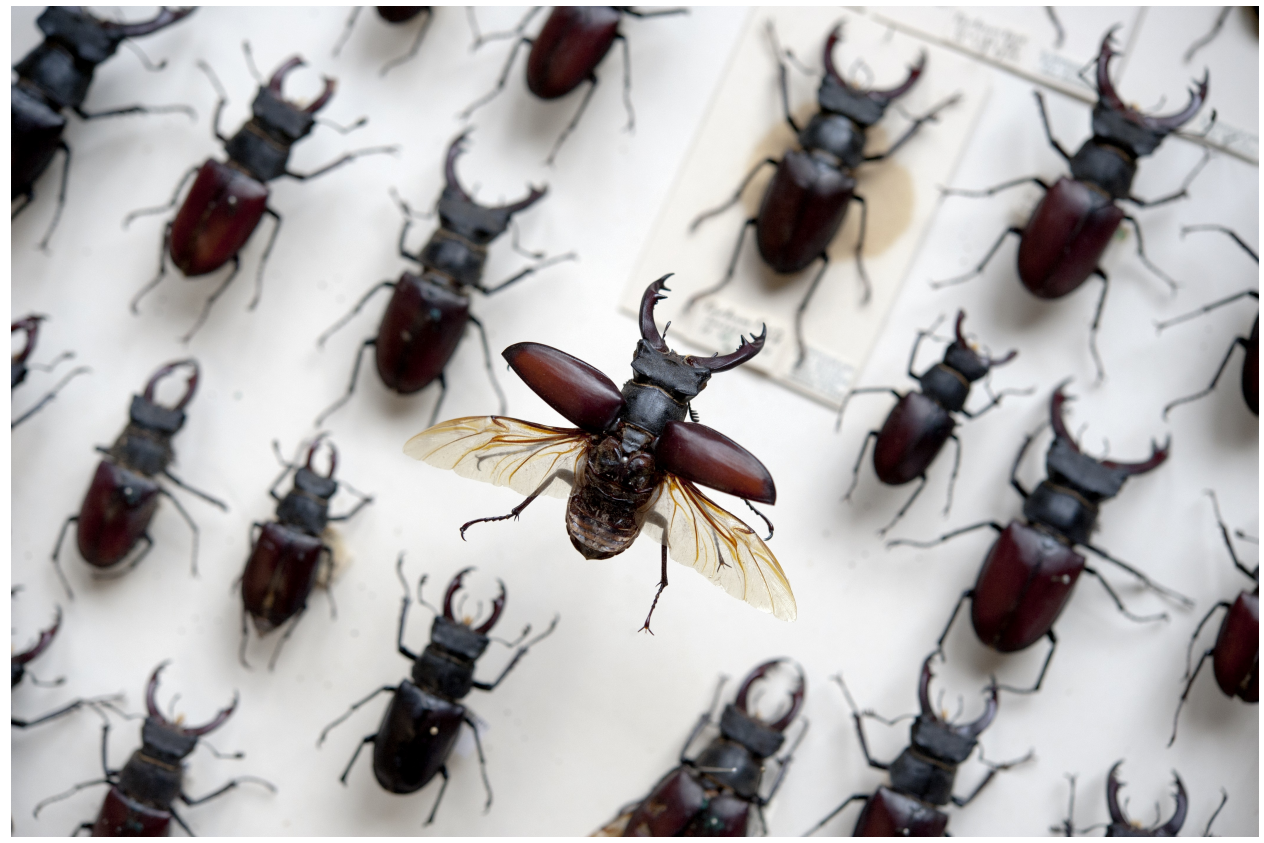
Stag beetle collection.

Supported by £703,700 from The National Lottery, the insects will be rehoused, undergo vital conservation and be fully documented for the first time.