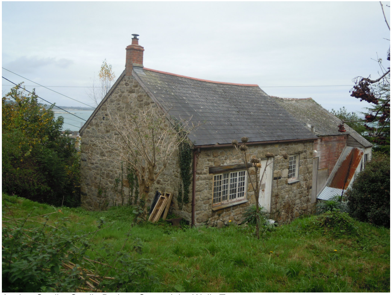
Anchor Studio

Five other projects have been given the go-ahead by The National Lottery Heritage Fund's new London & South Committee.