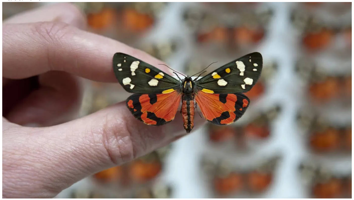
Plans to save a collection of a million bugs are among six projects celebrating a share of £8m from The National Lottery across London and the south of England.