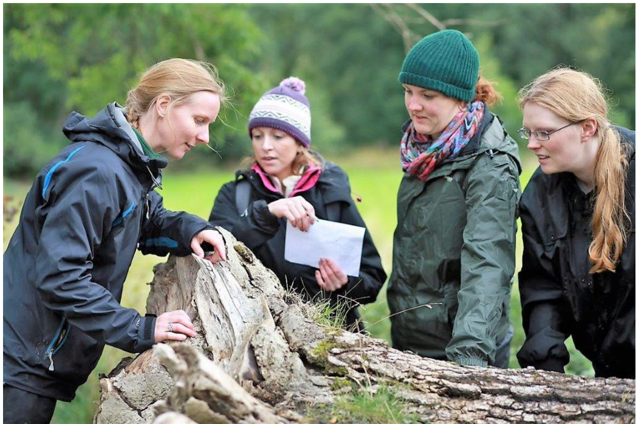
Student conservation volunteers - University of Cumbria

BOOM will be delivered in partnership with Morecambe Bay Partnership, Cumbria Wildlife Trust, Natural England and The Forestry Commission.