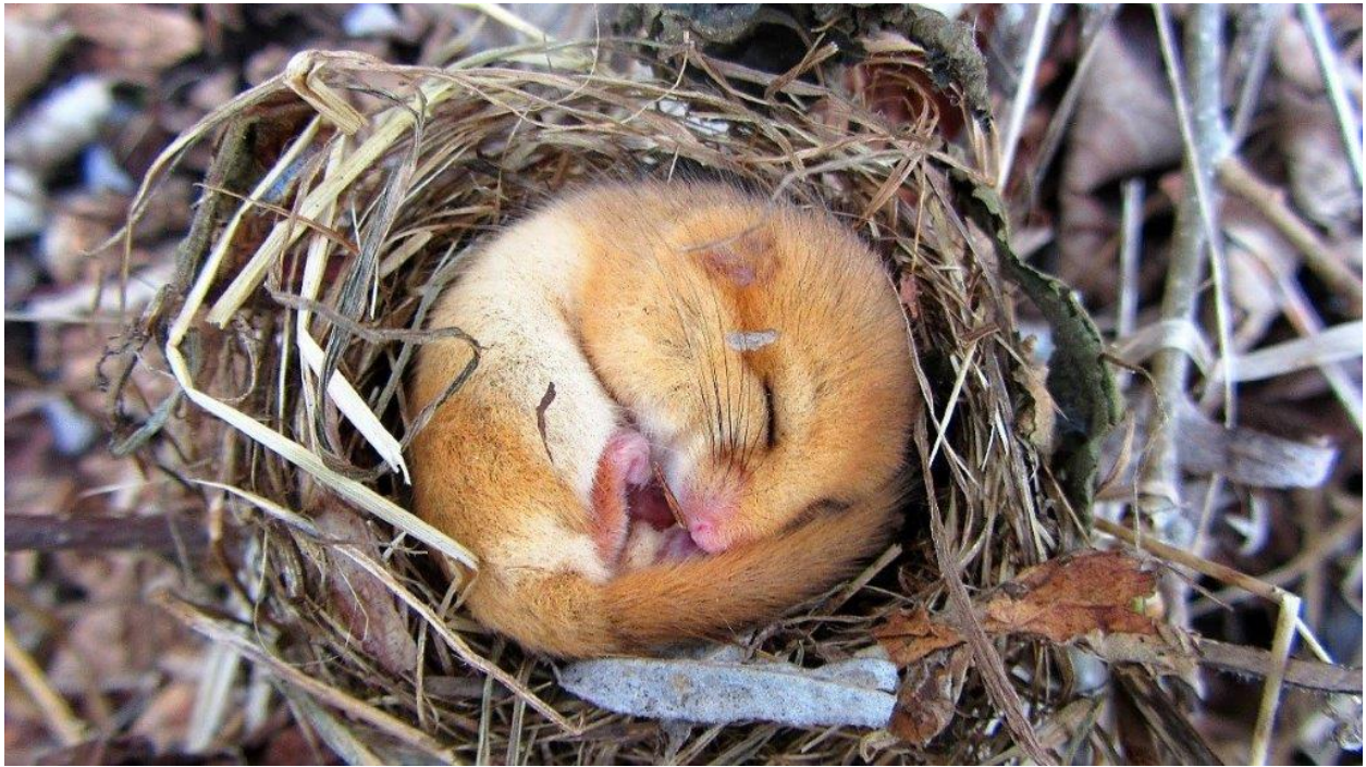
Hazel dormouse.

Back on Our Map (BOOM) is a four-year, University of Cumbria-led project fighting to save the future for the hazel dormouse, Duke of Burgundy butterfly and small blue butterfly in South Cumbria.