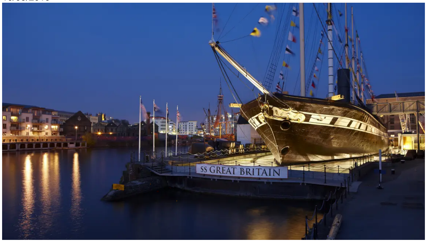
The Museums at Night festival kicks off on 15 May. We've put together 10 top events at some of our favourite National Lottery funded projects.