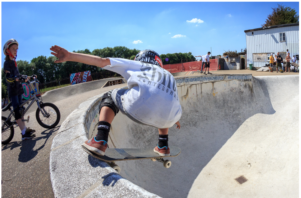
'The Pool' at Rom Skatepark