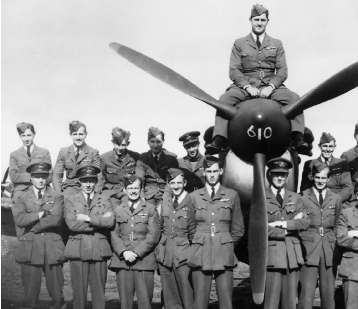
610 Squadron at Biggin Hill

The airfield that played a pivotal role in the Battle of Britain is now home to a National Lottery-funded museum, sharing the stories and voices of those who lived and served there.