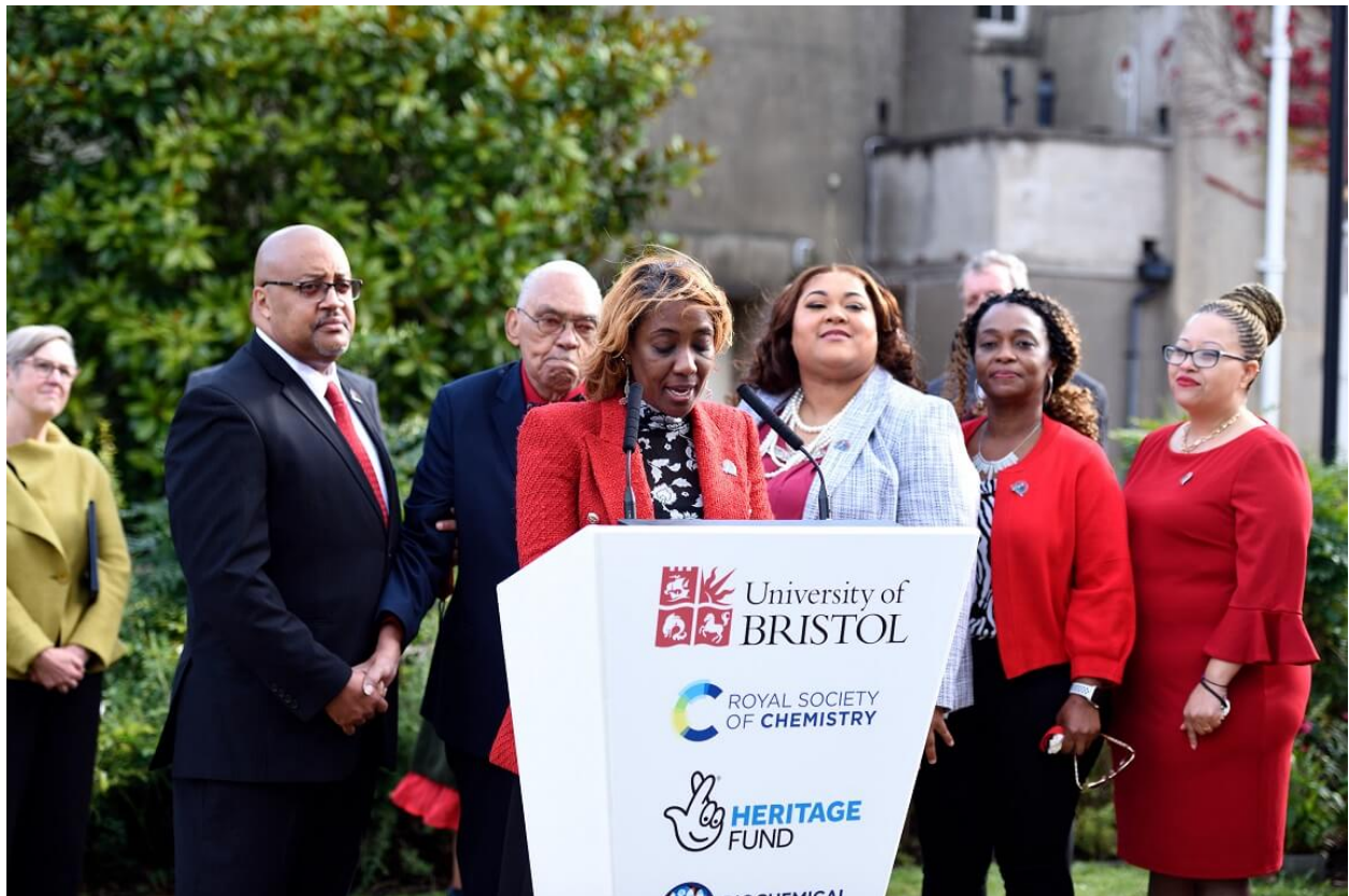
The Henrietta Lacks statue is unveiled by some members of the Lacks family.

The scientists who used Henrietta's cells in their research won awards and recognition, but rarely knew who she was. The continued use of the cells remains controversial, both inside and outside of the biomedical research community.