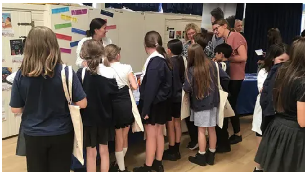
Activities engaged pupils of all ages.

Free primary and secondary school resources were shared online inspired by Henrietta's story, covering topics from science, medicine and art to history, humanities and philosophy. Older pupils visited the university's lecture theatres and teaching laboratories to learn more about cell biology and use the lab's high-tech microscopes.