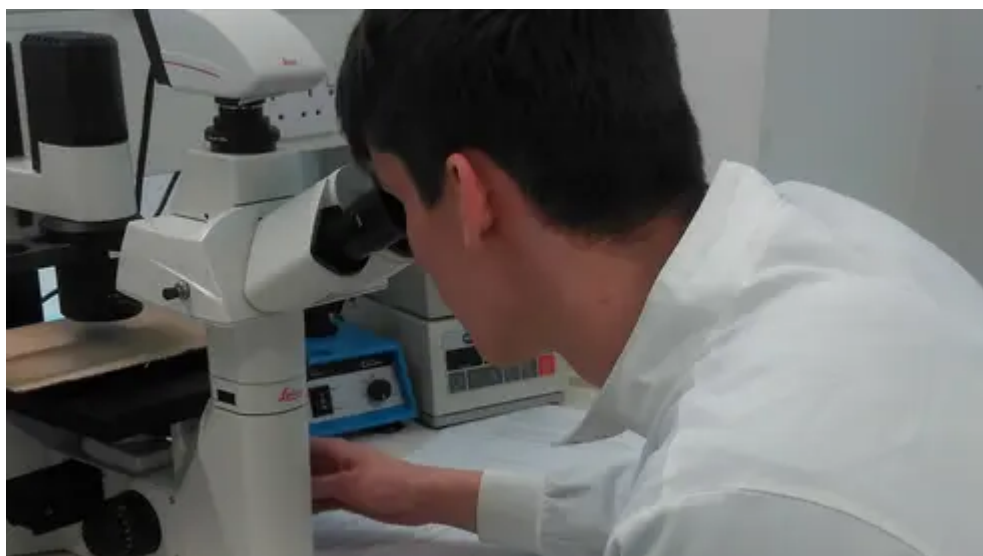
Using a microscope in the lab.

In-school and virtual learning sessions have engaged over 3,700 pupils, from reception class to Year 13, and adults. One teacher said: "There was a palpable buzz of excitement and curiosity around the room. You might have inspired some young people!"