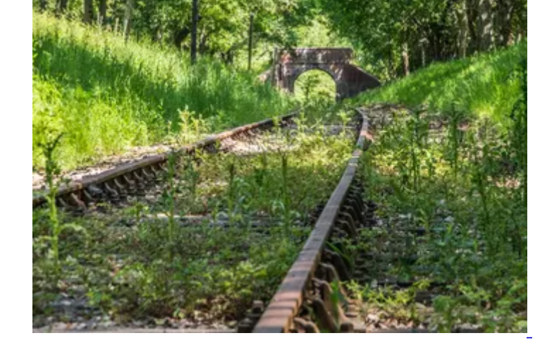
Undergrowth, Isle of Wight Railway.